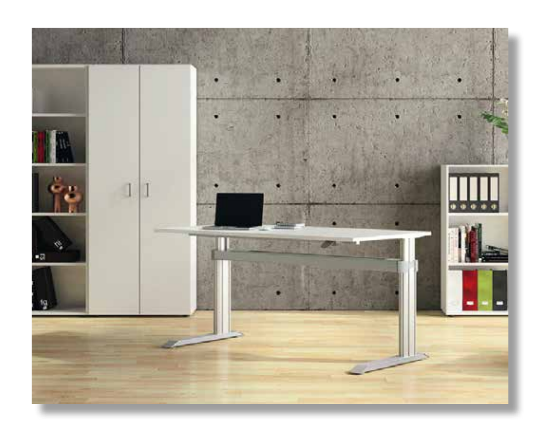
GO<sup>2</sup> Basic Sit-Stand WorkCenter